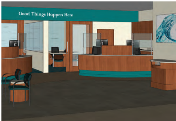
New full-service Gather in-store branch office opens in Līhu'e Walmart in April 2022.

At Gather FCU, we're always working to improve the experience of our members, including products and services, hours of operation, security and technology, staff and branch office locations.